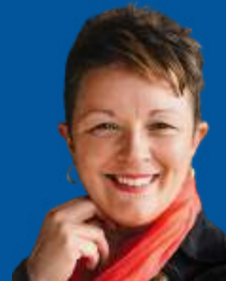
Angela TenBroeck Center for Sustainable Agricultural Excellence & Conservation