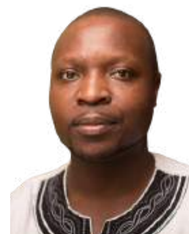
William Kamkwamba The Boy Who Harnessed the Wind Moving Windmills